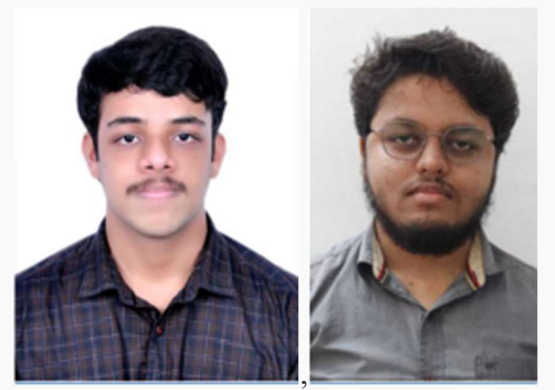
IIT Bombay Racing Team Brings Home the Title

The Royal Microscopical Society, Oxford, UK, holds image (Transmission electron and Scanning Electron Microscope) competition globally once in two years.