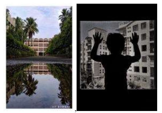
IIT Bombay Dean ACR team organised World Photography Day Contest

The team of IIT Bombay Dean ACR office recently held a photography contest on the occasion of World Photography Day, which was celebrated on August 19, 2020.