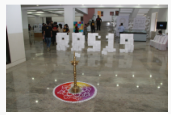
Design Degree Show (DDS) 2019

The Wellness Club of IIT Bombay, Yogastha organised the celebration of the International Yoga Day on June 21 in the campus.