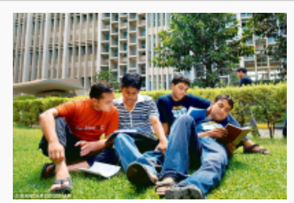
Beginning of new semester

The CSE department, IIT Bombay, along with the ACM Student Chapter of IIT Delhi, will be organising a four-day long summer school on AI assisted data analytics from July 11–14, 2019.