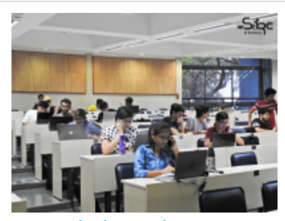
Annual Phonathon, XXXI

The 31st edition of the telephonic marathon, Phonathon, was conducted by the Student Alumni Relations Cell (SARC), IIT Bombay.