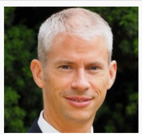
How the economy of culture is reshaping the world

The Indian Institute of Technology Bombay organised an Institute Colloquium on Friday, January 17, 2020 on the title : "Single-particle cryo-EM: Visualization of biological molecules in their native states"