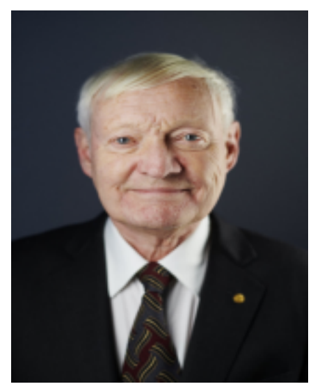
<u>Single-particle cryo-EM: Visualization of biological molecules in their native states</u>

The Indian Institute of Technology Bombay organised an Institute Colloquium on Friday, January 17, 2020 on the title : "Single-particle cryo-EM: Visualization of biological molecules in their native states"